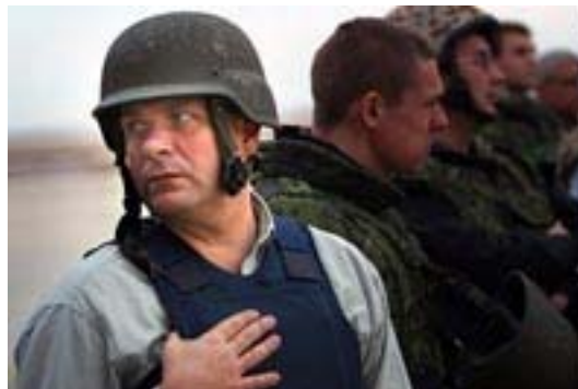
Denmark's Minister of Defence in Iraq