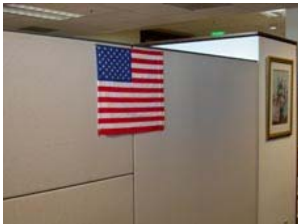
Official City Planning Office, Los Angeles, 2004

Since part of our research agenda has concerned the mode of presentation itself, it is here sufficient to give a brief description of the presentations made hitherto. This description will also provide a brief view of the content of the works produced.