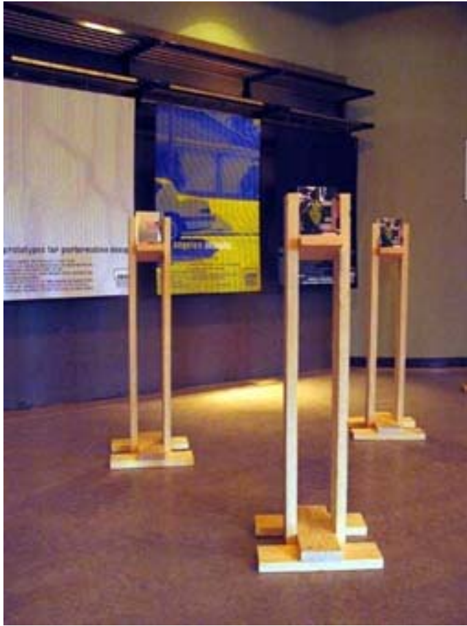
Los Angeles Islands' contribution to Art+Science

form simplicity and nature material as representing Scandinavian design, and the cliché of the postcard as representing a city.