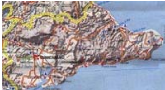
Map of Guantanamo, Cuba