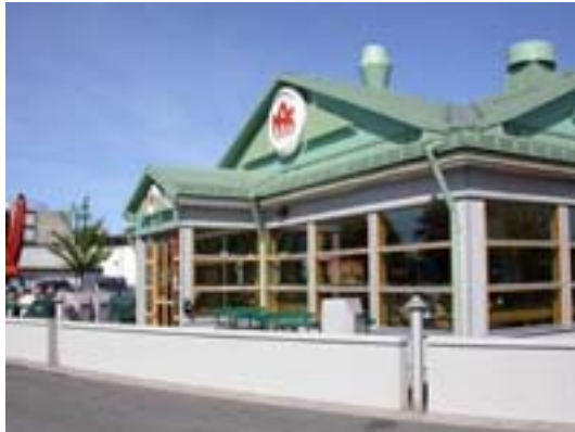
Max fast food restaurant, Lund, Sweden

images covering a wide range of cultural American influence and its contemporary global presence in the design of everyday life, of warfare architecture, etc.