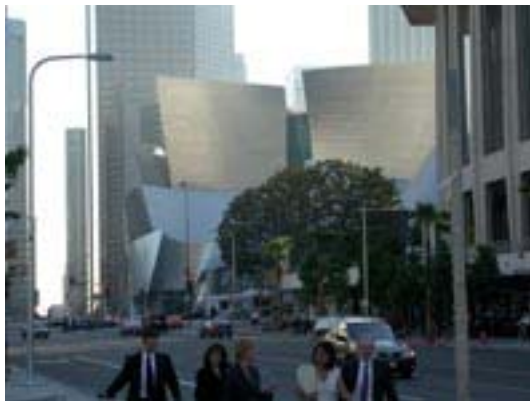
Centre of Los Angeles, Opera House (Frank O Gehry)