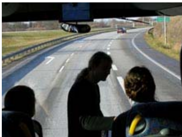
From Bus Tour, Los Angeles Islands: Malmö, Nov. 2003