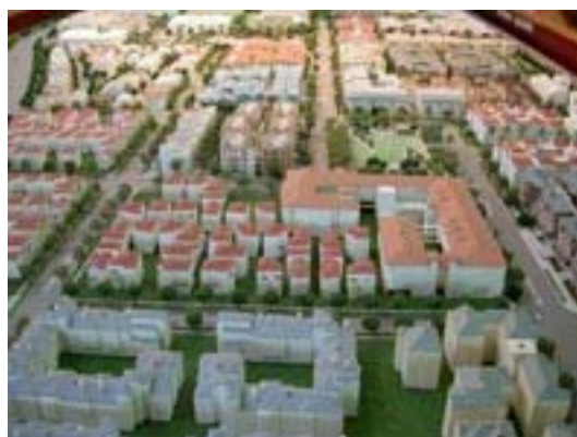
Model, Playa Vista, close to Ballona Wetlands