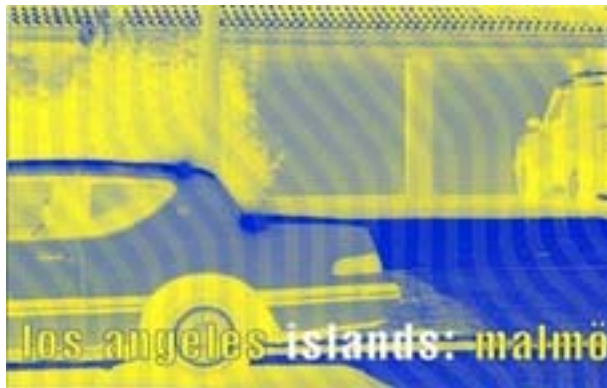
Invitation Card for Bus Tour Seminar, Malmö, Nov. 2003

The seminar bus was equipped with monitors that showed material specific to the seminar’s sites of interest. Reading acts and improvisations were held using the built in audio facilities of the bus. The bus tour seminar finished with a debate and film program at the cinema Panora in Malmö.